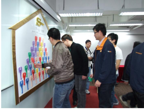
City Telecom staff under the “Next Station: University” program place symbolic keys into a Golden House with reference to the Chinese proverb that “Great Fortune (Golden House) is concealed in Books”