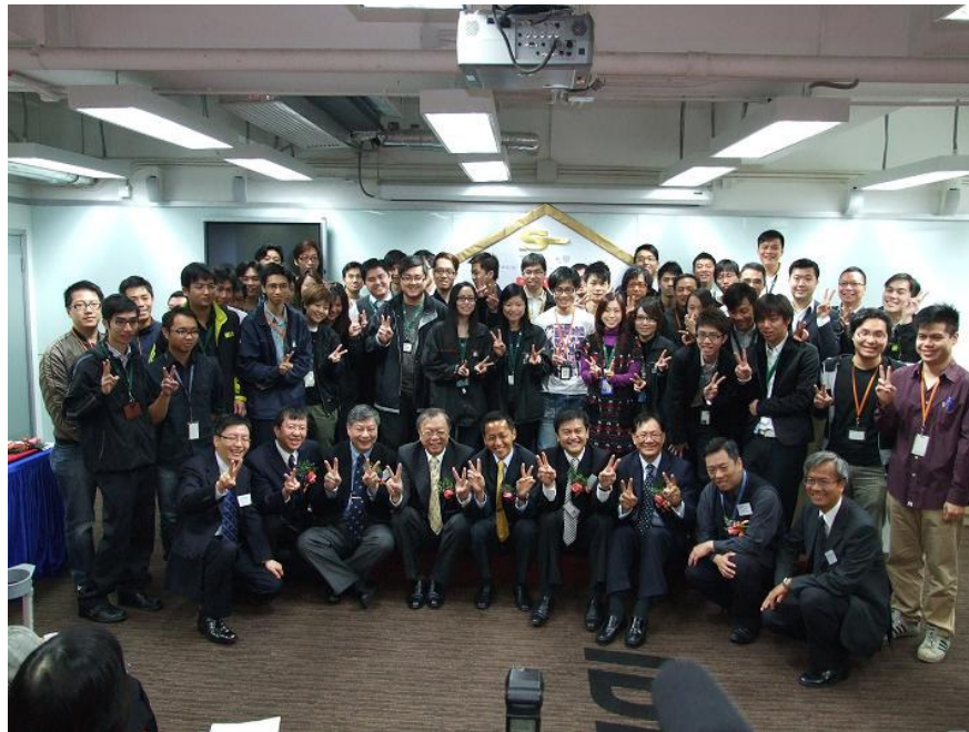
Senior Management of CTI, representatives of HKMA with all staff under the “Next Station: University” program