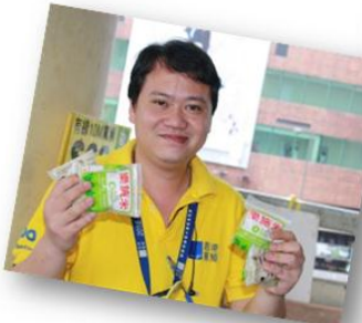
Oxfam Rice Charity Sale