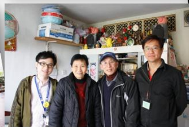
4 Weeks Home Cooked Hot Soup Delivery to Elders