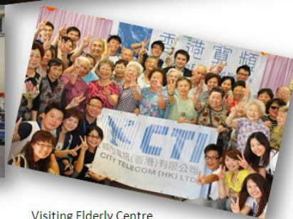
Visiting Elderly Centre