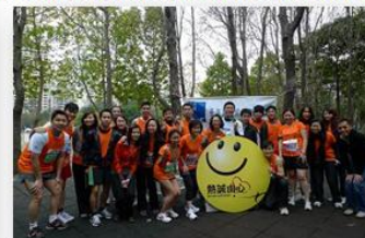
"Life · Program · Exploration" Program for HK & GZ Talents