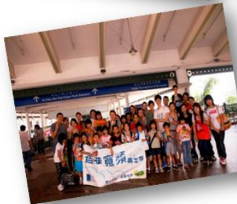
Po Leung Kuk children Outward Bound