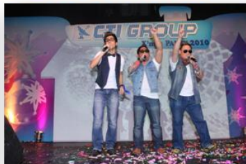
Annual X'mas Party for 3,200 Talents in HK & GZ