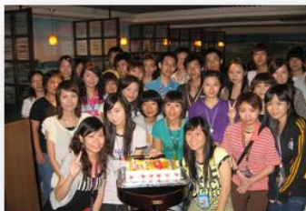
Outward Bound for GZ Talents