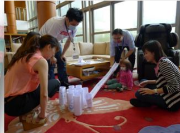
Visiting McDonald House