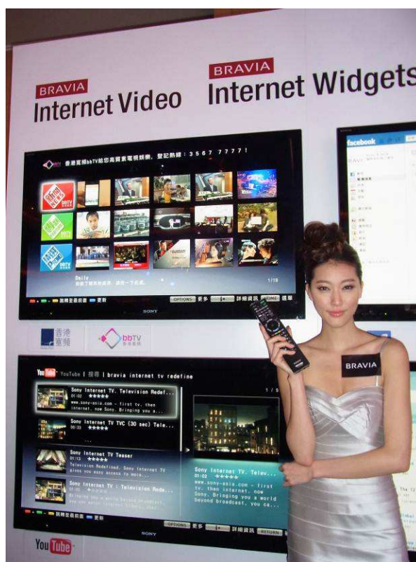
The new HKBN bbTV apps are installed in Sony's latest BRAVIA 3D Internet TV series.