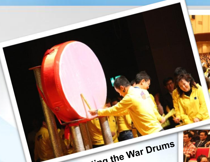
Beating the War Drums