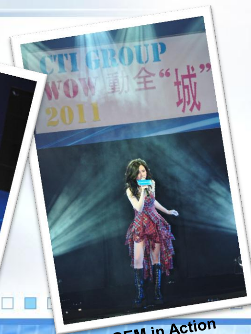
GEM in Action

“Happy Talents Bring Happy Customers’. We are always looking for ways to delight our Talents, especially after their outstanding contributions over the past year.”