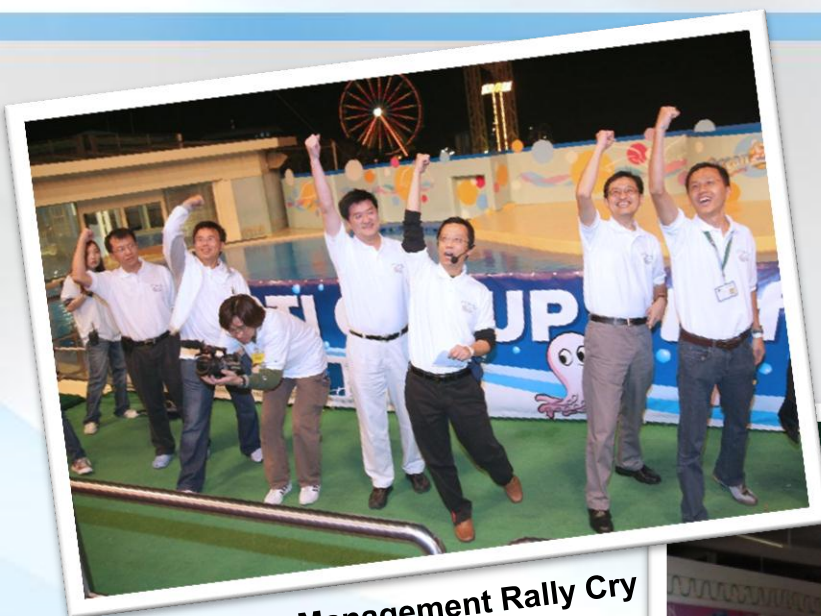
Management Rally Cry