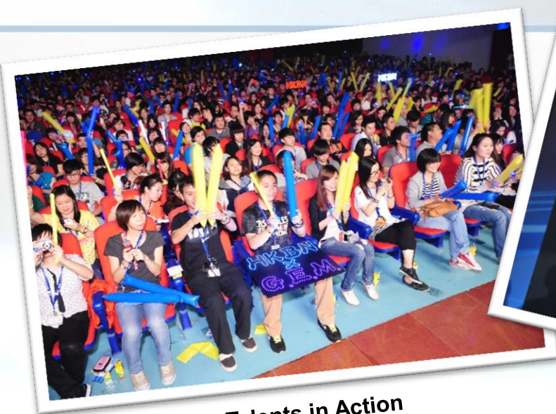
Talents in Action