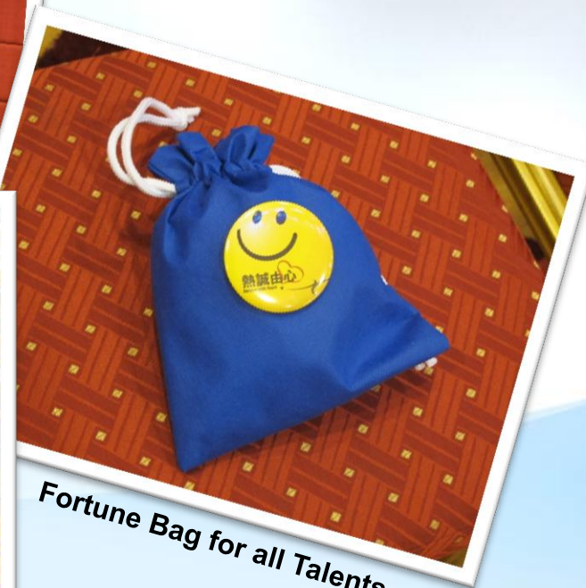
Fortune Bag for all Talents