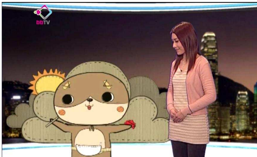
Din-dong, a local cartoon character, share the latest weather report with the users